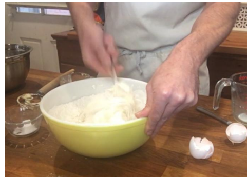
Wiebe makes bread dough while preaching an online sermon for the Synod of the Covenant.