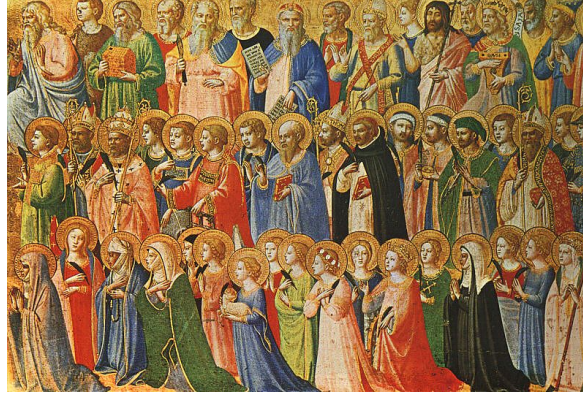
Fra Angelico, 1420