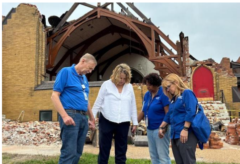
Presbytery staff pray outside the destroyed Cote Brillante Church.