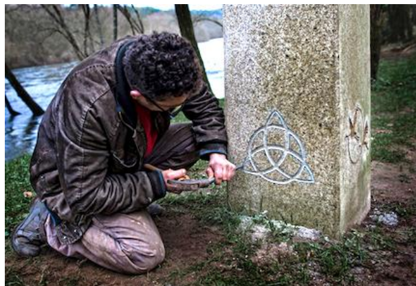
Trinity photo by Noel Feans—Vanderbilt Divinity Library, Nashville, TN. A stone stele along a path that leads to Santiago de Compostela, an important pilgrimage site.

O LORD, our Sovereign, how majestic is your name in all the earth!