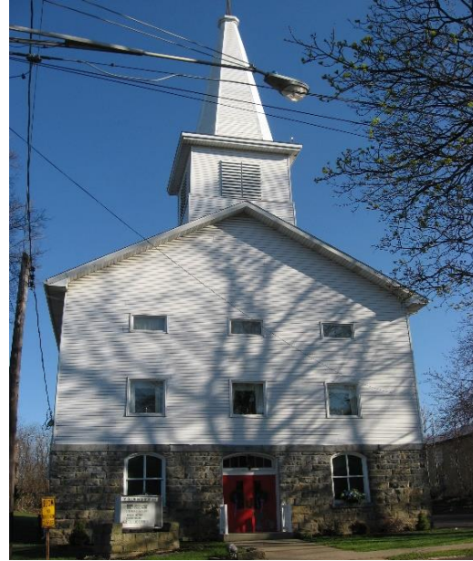
The Galilean Presbyterian Church PCUSA 1959