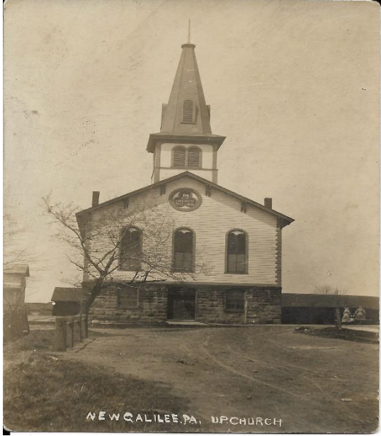
Rocky Spring U.P. Church founded 1828